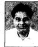
Sri Gautam Bora Hon'ble Education Minister, Assam

“DISE Week” From 29th September, 09 to 6th October, 09