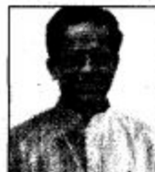
Sri Tarun Gogoi Hon'ble Chief Minister, Assam

“DISE Week” From 29th September, 09 to 6th October, 09